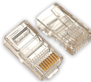
Unshielded RJ45 Connectors